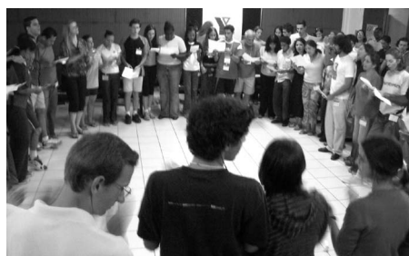
▲ February 2005: Over 100 Latin American Christian students join together to pray the UDPS liturgy in the lead up to the World Social Forum in Porto Alegre, Brazil.